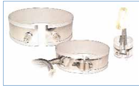
Mica Band Heater

Rowe Equipment supplies electrical heaters and sensors to many different industries, from packaging to injection and extrusion molding, rubber extrusion and mold makers. We offer Mica Band, Mica Strip, Ceramic Band, Channel Strip, Cartridge, Cable Coil and High Performance Heaters as well as Thermocouples. We insure the highest quality heaters and stand behind our products with a superior level of before and after sales service.