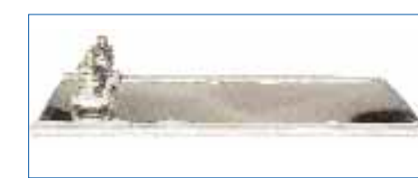
Mica Strip Heater